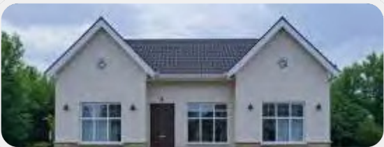
3 Bedroom Fully Detached Villa