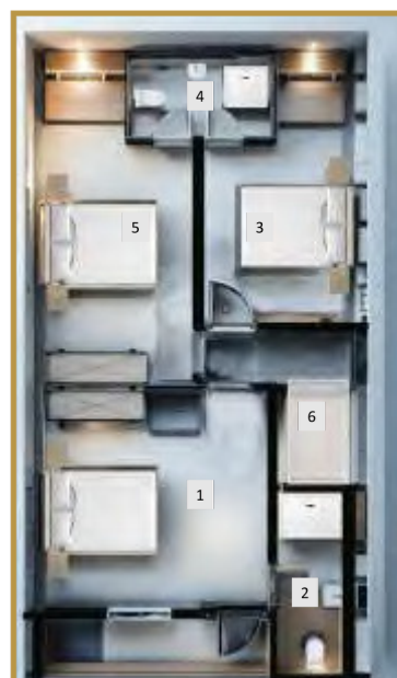
Second Floor Layout