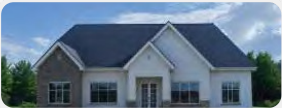
3 Bedroom Fully Detached Villa With BQ