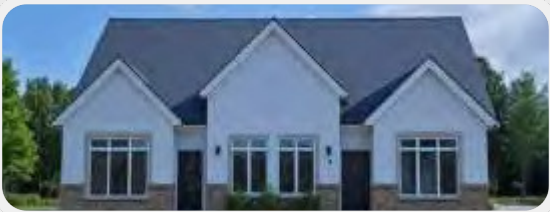
2 Bedroom Semi Detached