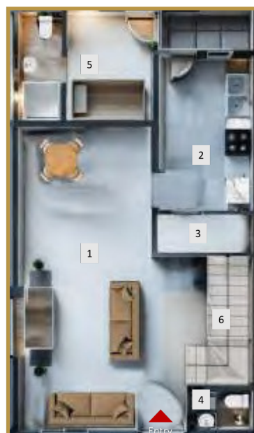
First Floor Layout